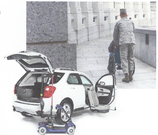
Scooter lifts, turning seats, and driving accessories