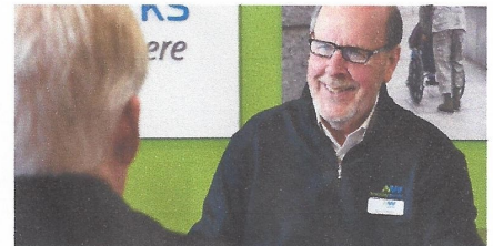
Certified Mobility Consultants Provide Comprehensive Needs Analysis

MobilityWorks is committed to serving you. Contact us today so we can evaluate your needs and find a solution that best fits your lifestyle.