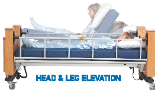
HEAD & LEG ELEVATION