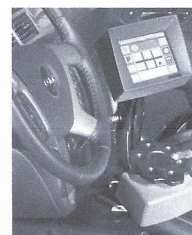
Electronic control systems