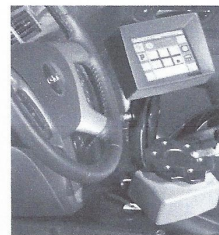
Electronic control systems