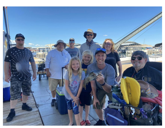
Nevada PVA & Bay Area & Western PVA Northern Nevada Two Day Outing