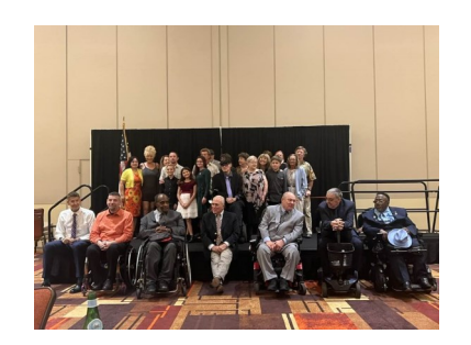
Corporate Sponsor Honoree, Tropicana Hotel