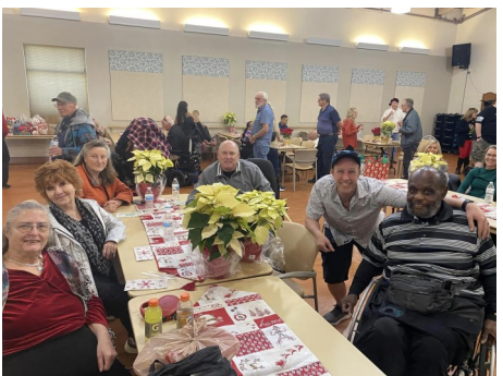
PVA Christmas Party