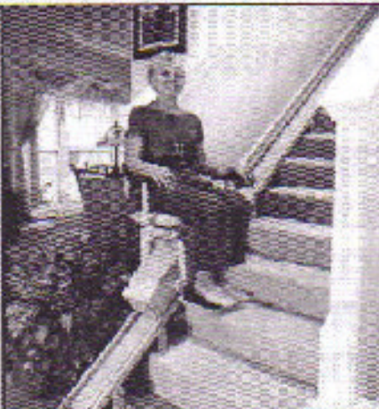
Now Featuring Stairlifts

Better Life Mobility offers excellent prices, service, and a 5-Star Mobility Dealership that specializes in quality adaptive equipment. Formally known as Disabled Mobility Systems, our staff has worked hard in the Las Vegas Area since 1998. We offer a wide variety of Durable Medical Equipment, Wheelchairs, Scooters, Powerchairs, Accessible Vans, Lifts, Carriers, Ramps, and much more! All of our Mobility Service Technicians are factory certified and NMEDA Quality Assurance Program Certified, so you can rest assured that you are in better hands with Better Life!